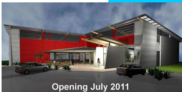
Opening July 2011

onships. The organising committee are working with the Tauranga Squash Club, who are building a brand new facility in conjunction with Tauranga Boys High School, to host the 2012 event. With a brand new court, the event will be an exciting one.