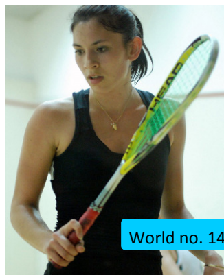
World no. 14 Joelle King